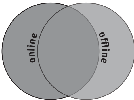
Figure 2 The online-offline overlap.

According to the Statement of Ethical Principles of the IFSW, “Social workers should promote the full involvement and participation of people using their services in ways that enable them to be empowered in all aspects of decisions and actions affecting their lives”. As people today increasingly populate the online world – in addition to leading life offline, more and more of both the public and personal features of everyday life are carried out partly or fully in online environments. Sub-studies II and III in this dissertation show that the online environment is an important arena for involvement and participation among young people. Sub-studies I and IV explore how people use online environments to seek advice and social support either privately or by attending online support group. Referring to the idea introduced by Jane Addams (see Chapter 1) one century ago, it is important that social workers settle among people in need. Transferring this to a present-day context, it is important that they are now present offering help and support in both online and offline environments. Considering the Ethical Principles of the IFSW, I argue that from a social work point of view, it would be unethical to ignore being present in either domain.